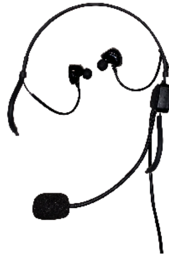
CHS-HHLTL-DMG Hard Hat Headset

CrewPlex, LLC 205 Technology Parkway Auburn, Alabama 36830 USA www.crewplex.com Phone +1.334.321.1400 Fax +1.334.321.1162